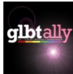
Gay Lesbian Bisexual Transgender Ally

ganizations which have attempted to make the culture of a campus or workplace more aware and accepting of gay, lesbian, bisexual, and transgender individuals.