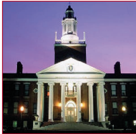
Bridgewater State College's Boyden Hall

"Through a campus-wide commitment to civility, respect and equality, and the promotion of academic excellence,