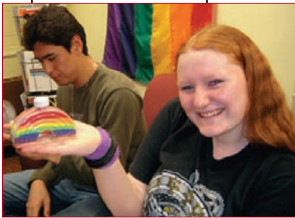
Bridgewater State College students at the GLBTA Pride Center.