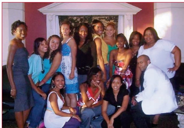
Students from the Center for Multicultural Affairs attend the Ebony Fashion Show at the Venus de Milo in Swansea.